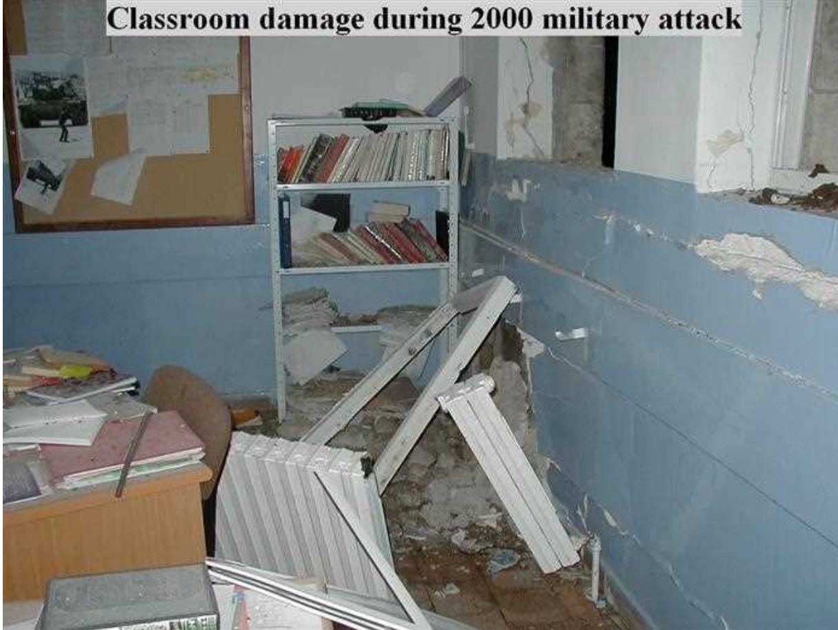
Classroom damage during 2000 military attack