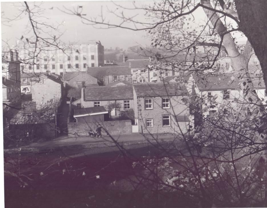
Fig.2: The meeting house prior to the west extension added in 1993

Committee for Famine Relief, the forerunner of Oxfam. A loft floor was inserted here and used for overnight accommodation from 1972. In 1988, the wooden floor in the meeting house was removed and the stone flags reinstated. To the west end the earlier lean-to extension was extended for a new lobby and WCs in 1993, to replace the old privy. The render was taken off the external walls, the stonework repointed and the interior lime-plastered. At the south end of the burial ground the stable was gradually adapted as a cottage for a warden, and in the 1950s a timber children's room was built in the south-west corner of the site (Fig.2). This was replaced by the New Room in 1994, built onto the cottage.