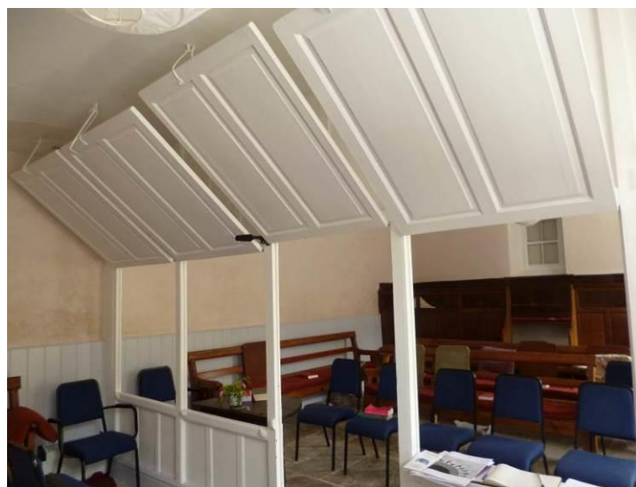
Fig.4: screen with shutters from the west

Inside, the meeting house, the larger meeting room is to the east, entered directly from the central door. The walls are lime-plastered above a painted timber tongued and grooved dado, and the floor is laid with stone flags. The elders' stand to the east end may be original; it is of oak with simple lineal mouldings and there is graffiti, including the name B.Talwin and the date 1731. There are signs the stand panelling was previously painted or lime-washed. The fixed benches either side of the central steps have fielded panels to the back, probably c1761. The small sash window (blocked) behind the centre of the stand is nineteenth century. The flat ceiling is plastered with the soffit at a higher level than the ceiling in the west room. The painted timber partition dividing the space has fielded panels consistent with a date of c1761; there is a central door below a pair of wider panels suggesting this was the primary doorway (the doors have been removed but are in store). The upper part of this doorway and the openings either side have top-hinged shutters which are fixed to the ceiling using iron hooks, enabling the spaces to be combined, above a low dado level. The door to the south end of the partition is a later insertion. The smaller space to the west has a blocked fireplace to the west wall, and the same boarded dado as the larger space. The door to the south side of the chimney is a modern insertion.