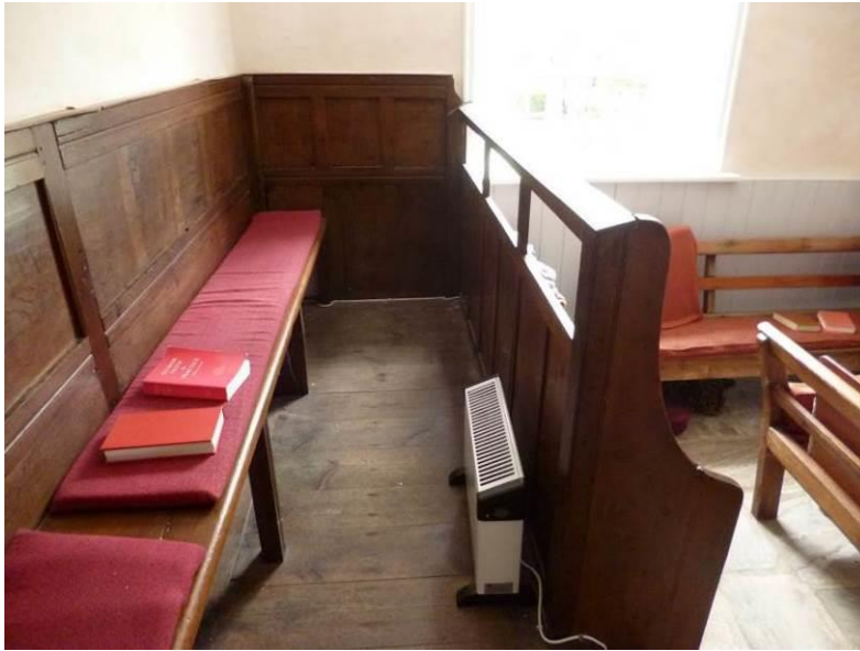
Fig.3: elders' stand with oak panelling

Inside, the meeting house, the larger meeting room is to the east, entered directly from the central door. The walls are lime-plastered above a painted timber tongued and grooved dado, and the floor is laid with stone flags. The elders' stand to the east end may be original; it is of oak with simple lineal mouldings and there is graffiti, including the name B.Talwin and the date 1731. There are signs the stand panelling was previously painted or lime-washed. The fixed benches either side of the central steps have fielded panels to the back, probably c1761. The small sash window (blocked) behind the centre of the stand is nineteenth century. The flat ceiling is plastered with the soffit at a higher level than the ceiling in the west room. The painted timber partition dividing the space has fielded panels consistent with a date of c1761; there is a central door below a pair of wider panels suggesting this was the primary doorway (the doors have been removed but are in store). The upper part of this doorway and the openings either side have top-hinged shutters which are fixed to the ceiling using iron hooks, enabling the spaces to be combined, above a low dado level. The door to the south end of the partition is a later insertion. The smaller space to the west has a blocked fireplace to the west wall, and the same boarded dado as the larger space. The door to the south side of the chimney is a modern insertion.