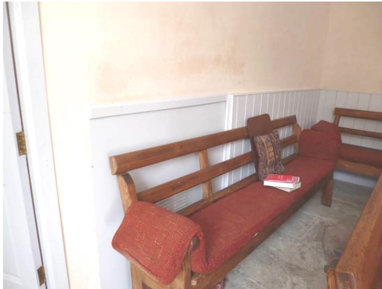
Fig.5: set of pine benches from Carperby meeting house

The set of plain pine benches are nineteenth century, and come from Carperby meeting (built in 1864).