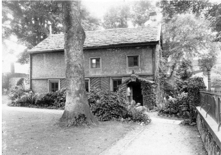
Fig.2: meeting house in 1912