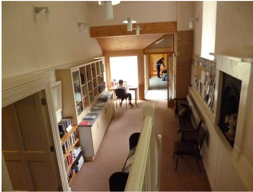
Fig.6: remodelled former institute, from the north