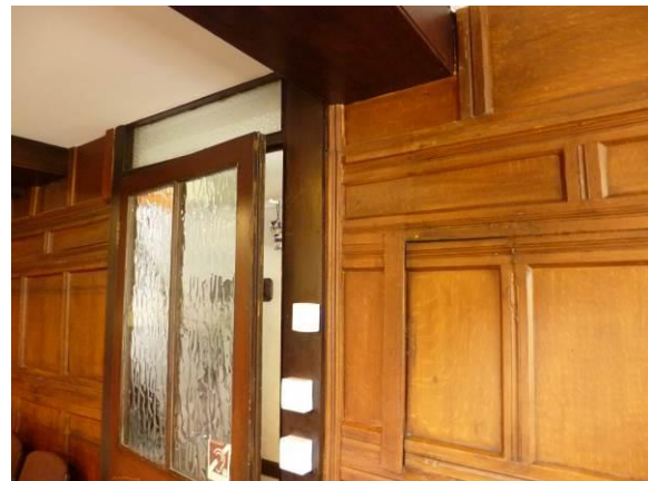
Fig.5: re-set wainscot in the entrance hall