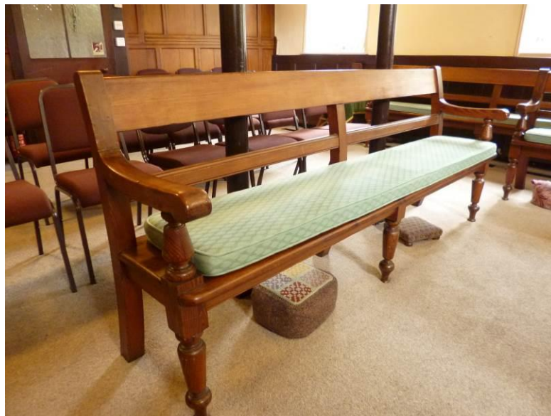
Fig.7: pine benches in the meeting room

The meeting room is furnished with a set of nine handsome pine benches with turned legs; these are probably Victorian. An oval table, probably of early nineteenth century date, is used in the centre of the room.