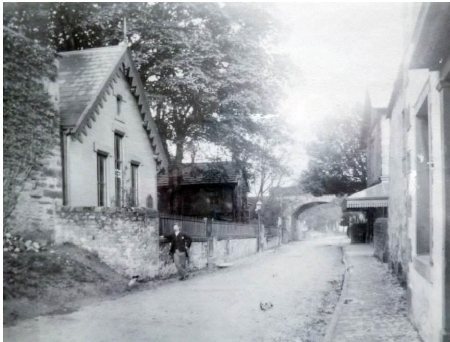
Fig 1: Kirkgate in c.1900 with 1872 Adult School to left and the meeting house beyond