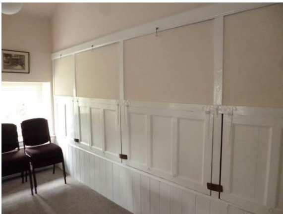
Fig.4: hinged shutters in gallery

The interior has one large meeting room that occupies all of the ground floor of the 1678 building, except for a passage across the north end, separated by a screen made of re-set oak wainscot panelling with a part-glazed door. The room has a plain panelled dado with grained finish, and plain plastered walls and flat ceiling. The deep gallery to the north is carried on a beam (reinforced in 2009 with steel) supported on cylindrical columns; the front of the gallery has hinged oak shutters with fielded panelling. The Elders' stand is to the south with late eighteenth century fielded panelling to the back and side walls (post-dating the blocking of the central window), a fixed bench and a nineteenth century panelled stand in front with moulded rail and turned finials. The floor is carpet on pine boards. The gallery is reached by a new staircase from the west wing and contains a nineteenth century chimneypiece. The floor of the west wing has been lowered to create a library and circulation area; the chimneypiece is retained but high on the west wall.