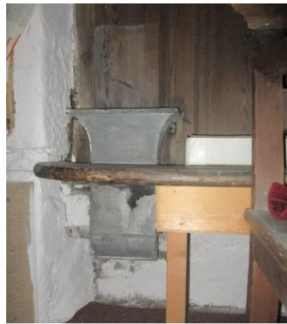
Figure 5: Tobin tube