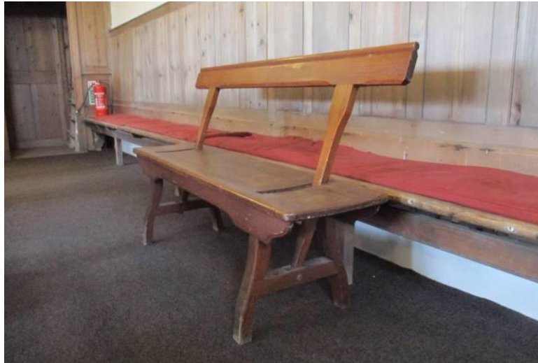
Figure 6: Bench with moveable back rest