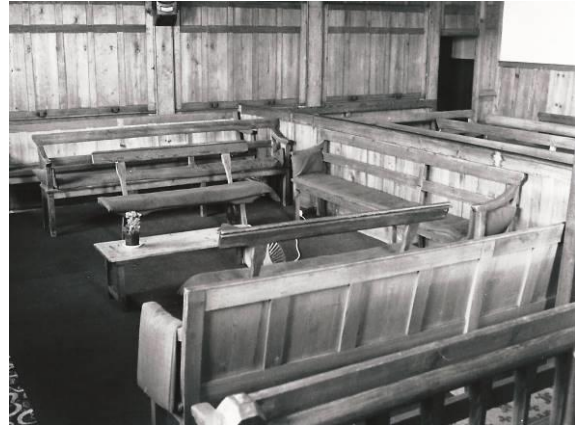
Figure 2: Panelled division in main meeting room, 1989 (image M162 courtesy of Aireborough Historical Society)

In 1989, consultation with the architect Michael Sykes regarding the installation of a hearing loop led to a full timber survey being carried out, which found that timber within the roof space was affected by woodworm. £33,000 was received through grants from English Heritage, and local and national Quaker Trust Funds. Whilst work was undertaken, which included the removal of both the steel posts and the 1850s outbuilding, Friends met in the school room within the former stables until the meeting house re-opened in 1991.