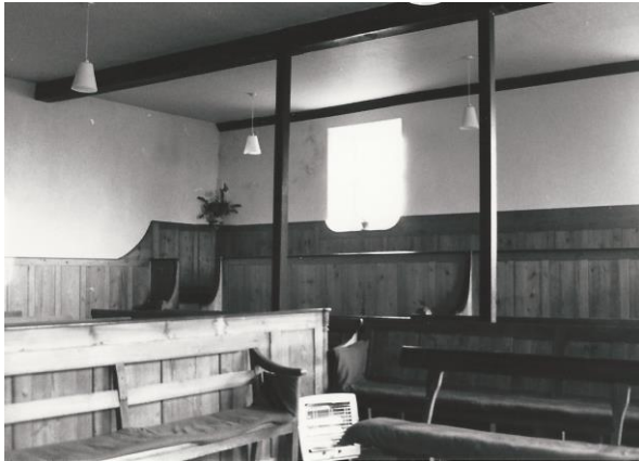
Figure 1: East side of the main meeting room, 1989 (image M160)