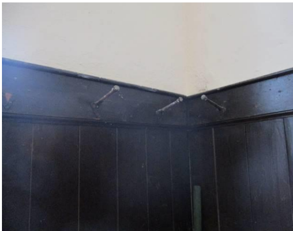
Figure 4: Hat pegs

Inside, the lobby area provides access to the small meeting room and the main meeting room. The lobby has joinery dating from the early nineteenth century including; tongue and groove panelling with turned wooden hat pegs and coat hooks, a fitted cupboard and safe to the northeast. The main meeting room retains vertically-sliding shutters to the northwest, raised Elders' stand to the southeast with the recently relocated panelled room divide in front, fixed benches to three sides, and underneath the windows to the southwest of the meeting room are Tobin tubes for ventilation. The ceiling is supported on two timber beams and lit by six pendant lights. The small meeting room to the north east corner of the meeting house has the rear exit doorway to the northeast, the walls are lined with a mixture of tongue and groove panelling, with fixed seating to the northwest. The room is divided from the lobby area by the rear of the fitted piece of furniture in the lobby and additional panelling. Similarly to the main meeting room a Tobin tube is located under the window on the northwest wall, through one of the fixed benches.