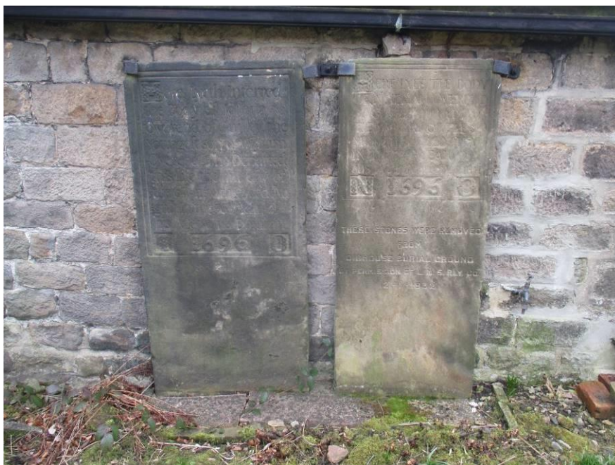
Figure 7: Two gravestones dated 1696 relocated from Dibb House Farm burial ground

The burial ground is still in use for burials and forms an L-shape to the southwest and northwest of the meeting house. It is enclosed by a dry stone wall and is well planted with mature trees and planting. The burial ground has a uniform character with rows of small round headed headstones with basic information inscribed according to Quaker tradition. Burial records are located in Brotherton Library Special Collections at the University of Leeds and cover an approximate date range from 1837 to 1988. Located on the northeast wall of the school room are two gravestones to Nathan Overend and Joshua Overend dated 1698 which were relocated from the former burial ground at Dibb House Farm.