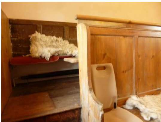
Fig.2: stand with fixed benches of varying dates

The meeting house interior is divided into two unequal spaces with the main meeting room to the south-west. The stand is against the south-west wall; this has oak panelling to the rear dado, end steps, a fixed pine bench to the front, and pine tongue and grooved dado to side walls, ramped to the stand; the pine joinery appears to be early nineteenth century in date, but the oak panelling is earlier. The smaller meeting room to the north-east is separated by a simple horizontally boarded oak screen with top-hung hinged shutters. Narrow stairs in the north-west corner lead to the gallery; the gallery floor is supported on a pair of chamfered posts and two chamfered beams with exposed joists and the gallery front is plainly panelled. The matching stone fireplaces on both floors, each have chamfered arrises and deep chamfered cornices. These fireplaces and the oak joinery are typical of the late seventeenth century. The ground floor fireplace has a nineteenth century cast-iron grate. Walls and the flat ceilings are plainly plastered with lime-wash finish. Floors are boarded in pine. The 3-bay roof has two tie-beam trusses with struts; one has curved principals.