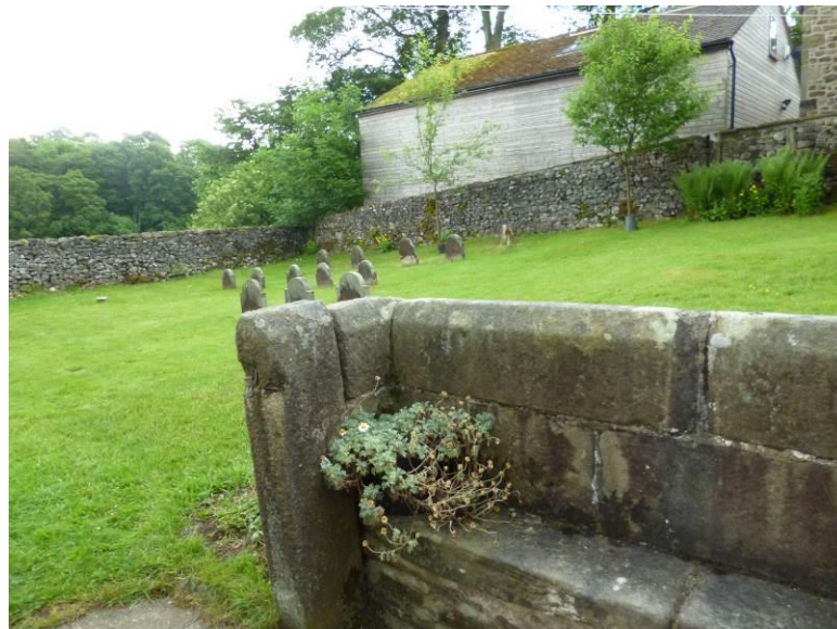
Fig.5: burial ground and stone bench set in wall, from the west

The sloping burial ground adjoins the meeting house on its south and east sides, enclosed by drystone walls. The roughly L-plan area is laid to grass with rows of head stones towards the east end; the stones have arched tops in the usual Quaker style, dating from the second half of the nineteenth century. A low ashlar wall separates the paved yard on the south-east front of the meeting house from the burial ground; the wall has an integrated stone bench to the side facing the meeting house and the top of the wall is chamfered. This unusual feature is hard to date; it is said to be seventeenth century in date, but may be later. A gateway with flat