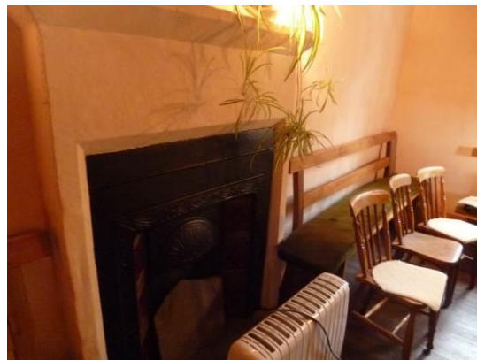
Fig.3: one of two stone fireplaces in the smaller rooms to the east end