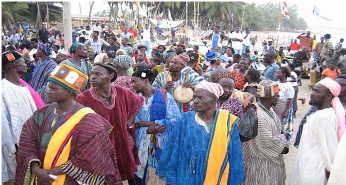
12 Tribes represented at the Wilberforce “Freedom Festival”, Fort Anomabo, Ghana, in March 25 th 2007, gathering to walk together into the Fort.

Part of the scheme is the provision of a hospital boat. The proposals have the ear and trust of experienced and qualified personnel who can present surveys and feasibility studies, and of the Chiefs and Elders and, to ease the way, the blessings of entrepreneurial women! All this has been captured on camera and a full-length film is planned, including drone use, to explore and survey each location from Akosombo in the South to beyond Singa village (our main centre) in the North.