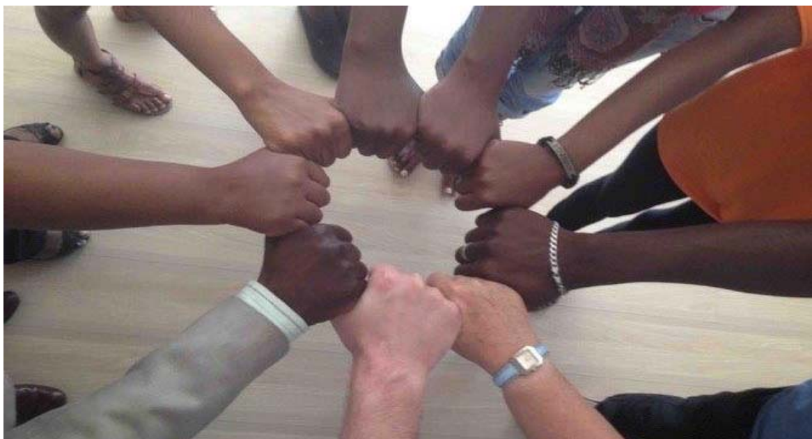
Hands at the AGM of Alternatives to Violence, Namibia